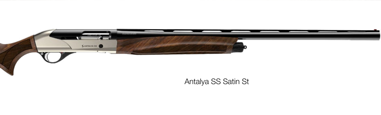
Antalya SS Satin St