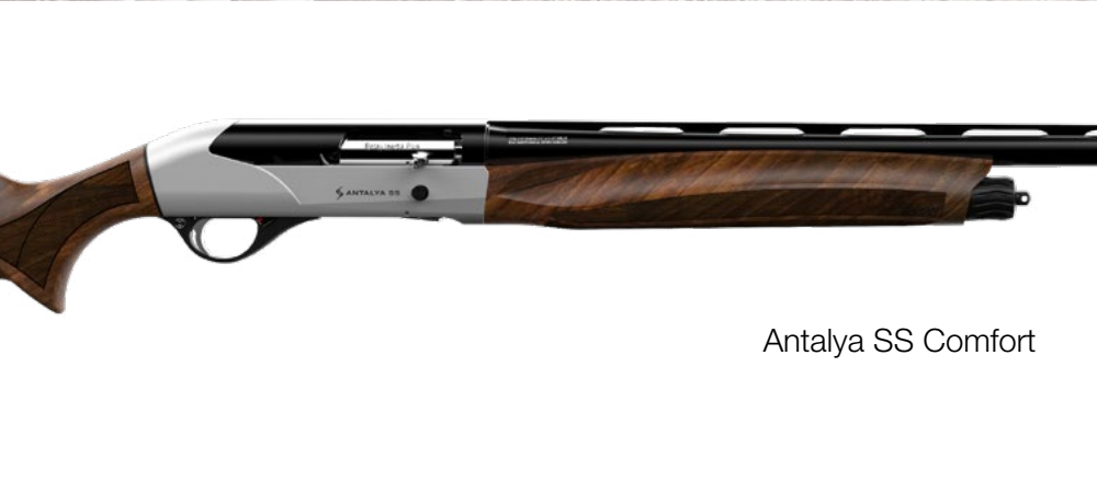
Antalya SS Comfort