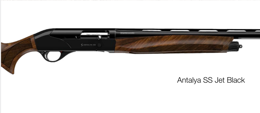
Antalya SS Jet Black