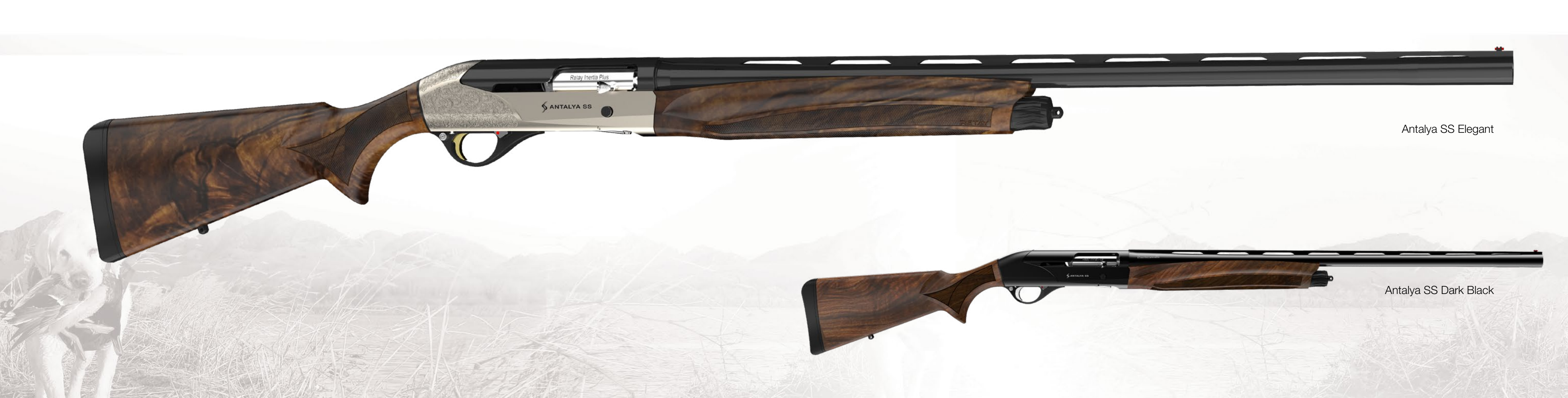
Antalya SS Elegant